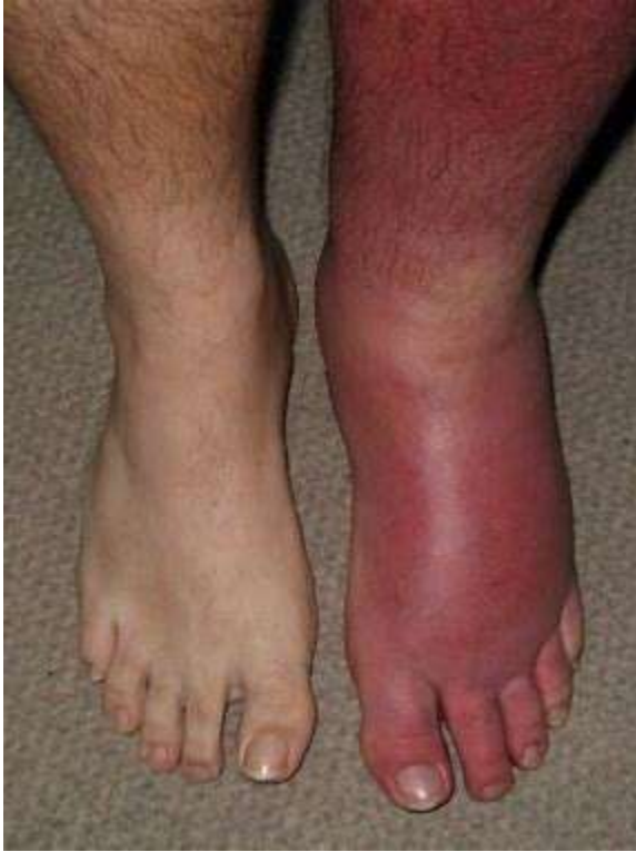
IMAGE: primary lymphedema