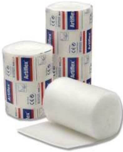
IMAGE: grey foam